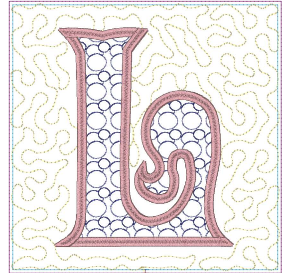
L Block 7x7.vip 7.00x7.00 inches; 16,329 stitches 8 thread changes; 6 colors