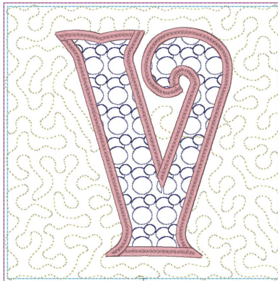
V Block 7x7.vip 7.00x7.00 inches; 14,884 stitches 8 thread changes; 6 colors