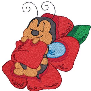
Save The Bees - 010.vip 4.73x4.70 inches; 19,145 stitches 20 thread changes; 11 colors