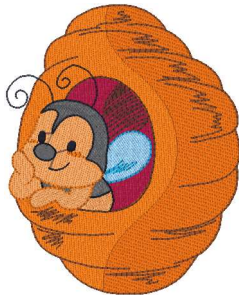
Save The Bees - 007.vip 4.04x4.99 inches; 22,361 stitches 13 thread changes; 10 colors