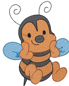
Save The Bees - 008.vip 3.78x4.72 inches; 13,162 stitches 9 thread changes; 6 colors