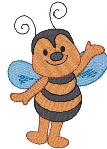
Save The Bees - 003.vip 3.26x4.72 inches; 10,758 stitches 8 thread changes; 6 colors