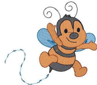
Save The Bees - 006.vip 5.00x4.50 inches; 10,778 stitches 9 thread changes; 6 colors