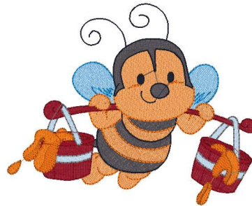
Save The Bees - 002.vip 5.90x4.76 inches; 22,350 stitches 18 thread changes; 12 colors