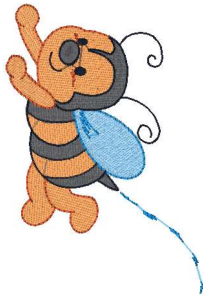
Save The Bees - 004.vip 3.19x4.72 inches; 8,828 stitches 8 thread changes; 6 colors