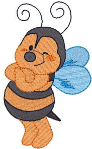
Save The Bees - 001.vip 2.81x4.72 inches; 10,908 stitches 9 thread changes; 7 colors