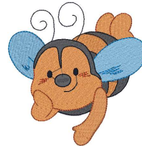
Save The Bees - 009.vip 4.53x4.70 inches; 14,527 stitches 10 thread changes; 6 colors