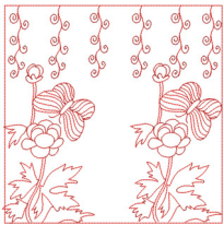
V-Butterfly-Design - 7in.vip 7.09x7.02 inches; 7,840 stitches 1 thread changes; 1 colors