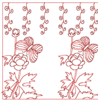
V-Butterfly-Design - 5in.vip 5.12x5.07 inches; 6,302 stitches 1 thread changes; 1 colors