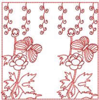
V-Butterfly-Design - 4in.vip 3.94x3.90 inches; 5,301 stitches 1 thread changes; 1 colors