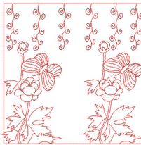
V-Butterfly-Design - 8in.vip 7.87x7.80 inches; 8,365 stitches 1 thread changes; 1 colors