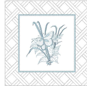
2021_butterfly_260_03.vp3 10.20x10.20 inches; 21,681 stitches 3 thread changes; 2 colors