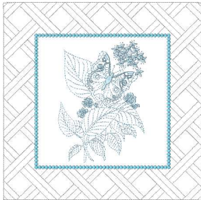
2021_butterfly_260_10.vp3 10.20x10.20 inches; 23,157 stitches 3 thread changes; 3 colors