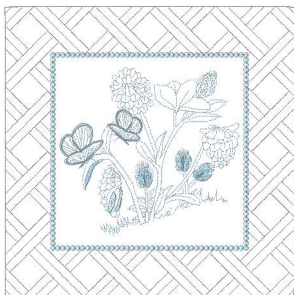
2021_butterfly_260_19_vp3 10.20x10.20 inches; 19,183 stitches 3 thread changes; 2 colors