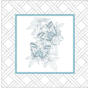
2021_butterfly_260_07.vp3 10.20x10.20 inches; 23,281 stitches 3 thread changes; 3 colors