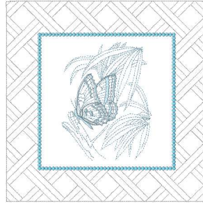
2021_butterfly_260_08.vp3 10.20x10.20 inches; 20,245 stitches 3 thread changes; 3 colors