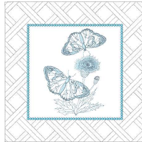
2021_butterfly_260_11.vp3 10.20x10.20 inches; 25,994 stitches 3 thread changes; 3 colors