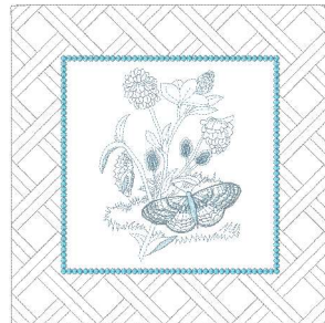
2021_butterfly_260_17.vp3 10.20x10.20 inches; 19,299 stitches 3 thread changes; 3 colors