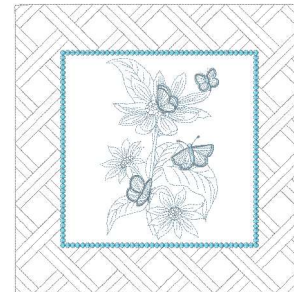
2021_butterfly_260_18.vp3 10.20x10.20 inches; 18,327 stitches 3 thread changes; 3 colors