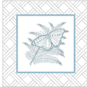
2021_butterfly_260_02.vp3 10.20x10.20 inches; 21,392 stitches 3 thread changes; 3 colors