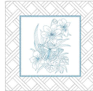
2021_butterfly_260_06.vp3 10.20x10.20 inches; 18,394 stitches 3 thread changes; 2 colors