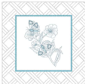
2021_butterfly_260_13.vp3 10.20x10.20 inches; 18,937 stitches 3 thread changes; 3 colors