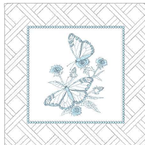
2021_butterfly_260_14.vp3 10.20x10.20 inches; 22,375 stitches 3 thread changes; 2 colors