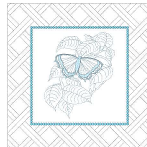
2021_butterfly_260_15.vp3 10.20x10.20 inches; 16,227 stitches 3 thread changes; 3 colors