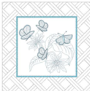
2021_butterfly_260_20_vp3 10.20x10.20 inches; 19,051 stitches 3 thread changes; 3 colors