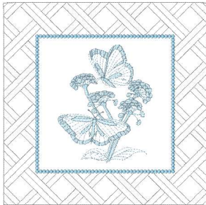
2021_butterfly_260_04.vp3 10.20x10.20 inches; 20,949 stitches 3 thread changes; 3 colors