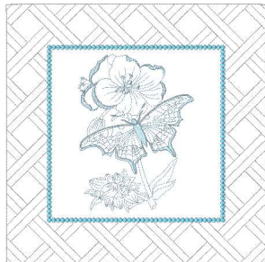
2021_butterfly_260_16.vp3 10.20x10.20 inches; 17,898 stitches 3 thread changes; 3 colors