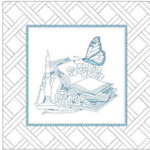
2021_butterfly_260_01.vp3 10.20x10.20 inches; 19,406 stitches 3 thread changes; 2 colors