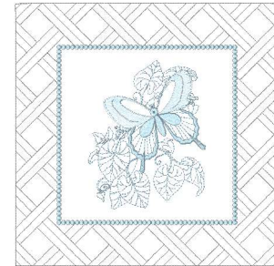
2021_butterfly_260_12.vp3 10.20x10.20 inches; 19,332 stitches 3 thread changes; 2 colors