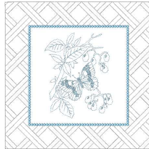
2021_butterfly_260_05.vp3 10.20x10.20 inches; 20,199 stitches 3 thread changes; 3 colors