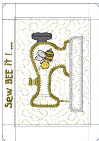
Sew Mr 2.vip

5.43x7.83 inches; 12,742 stitches 31 thread changes; 11 colors