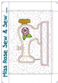
Sew Mr 1 Miss Rose.vip

5.43x7.83 inches; 12,917 stitches 31 thread changes; 11 colors