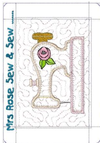
Sew Mr 1 Mrs Rose.vip

5.43x7.83 inches; 12,917 stitches 31 thread changes; 11 colors