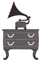
Vdpvintagechronograph8x10.vip 6.14x9.82 inches; 30,778 stitches 2 thread changes; 2 colors