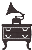
Vdpvintagechronograph5x7.vip 4.30x6.89 inches; 17,247 stitches 2 thread changes; 2 colors