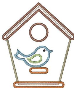
Bird And Birdhouse 2.vip 5.60x6.54 inches; 13,029 stitches 25 thread changes; 16 colors