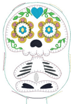
Dbb Sugar Skull Bear Body 6x10.vp3 6.07x9.02 inches; 21,612 stitches 30 thread changes; 16 colors