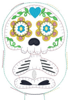
Dbb Sugar Skull Bear Body 5x7.vp3 4.76x7.07 inches; 15,683 stitches 30 thread changes; 16 colors