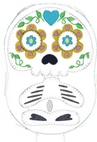
Dbb Sugar Skull Bear Body 8x12.vp3 7.73x11.50 inches; 29,566 stitches 30 thread changes; 16 colors