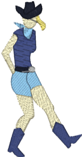
Linedance Lady 1.vip 1.80x3.50 inches; 3,906 stitches 6 thread changes; 6 colors