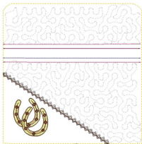
Western Purse Back Mylar.vip 7.79x7.85 inches; 7,330 stitches 15 thread changes; 8 colors