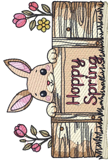
Design 2.vip 3.73x5.50 inches; 23,137 stitches 12 thread changes; 12 colors