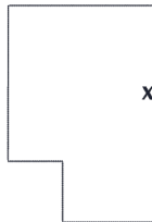
Pattern For Lining.vip

7.80x10.80 inches; 6,637 stitches 14 thread changes; 6 colors