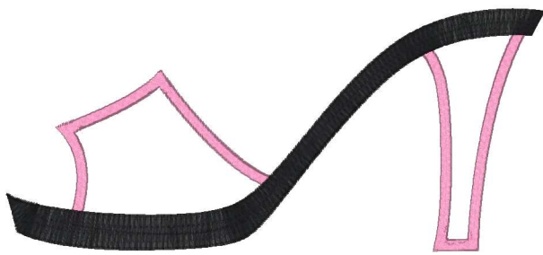
Open Toe Heel App 195.vp3 7.68x3.45 inches; 6,064 stitches 7 thread changes; 6 colors