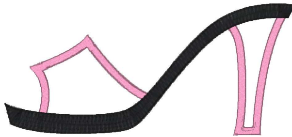
Open Toe Heel App 145.vp3 5.71x2.58 inches; 3,780 stitches 7 thread changes; 6 colors