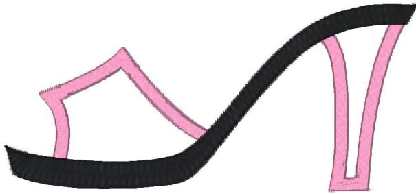
Open Toe Heel App 120.vp3 4.72x2.15 inches; 2,802 stitches 7 thread changes; 6 colors