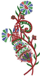
1 March P1 Ok.vip

4.81x9.39 inches; 26,208 stitches 3 thread changes; 3 colors