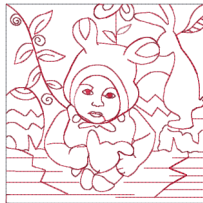
B-Baby-Bunny - 5in.vip

3.94x3.94 inches; 3,544 stitches 2 thread changes; 2 colors