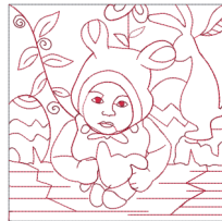
B-Baby-Bunny - 6in.vip

5.12x5.12 inches; 4,296 stitches 2 thread changes; 2 colors