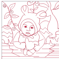
B-Baby-Bunny - 8in.vip

7.09x7.09 inches; 5,489 stitches 2 thread changes; 2 colors