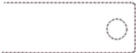
4x4 Band Pieces.vp3

2.79x3.16 inches; 779 stitches 2 thread changes; 2 colors