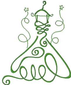
Bbe_wedding Dress 5 5x7.vp3 4.76x5.82 inches; 6,848 stitches 1 thread changes; 1 colors