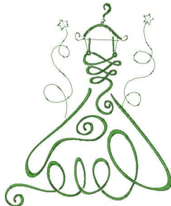
Bbe_wedding Dress 5 8x12.vp3 7.76x9.49 inches; 12,182 stitches 1 thread changes; 1 colors