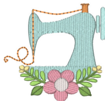
Mini Vintage Sewing Machine With Flowers 2.5 Inch.vip 2.50x2.36 inches; 4,906 stitches 7 thread changes; 7 colors