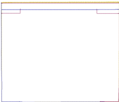
Zipper Part V6.vip

7.83x6.76 inches; 14,687 stitches 8 thread changes; 4 colors