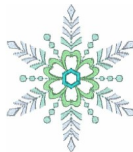
Æ eŠ a0_03.vip 2.57x2.95 inches; 2,894 stitches 4 thread changes; 4 colors