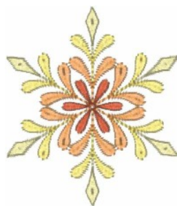
À eš a0 08 vip 2.31x2.69 inches; 1,748 stitches 4 thread changes; 4 colors