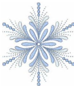
À eš a0 11 vip 2.57x2.94 inches; 3,084 stitches 2 thread changes; 2 colors