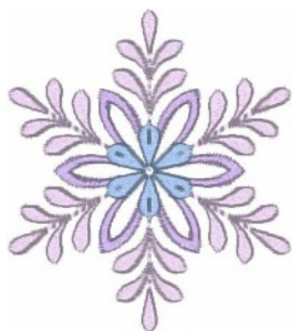
Æ eŠ a0_01.vip 2.24x2.56 inches; 2,794 stitches 3 thread changes; 3 colors