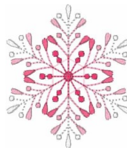
À eš a0 09 vip 2.54x2.95 inches; 2,323 stitches 4 thread changes; 4 colors