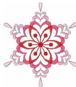
Æ eŠ a0_06.vip 2.56x2.94 inches; 2,251 stitches 4 thread changes; 4 colors