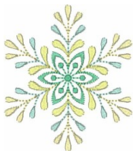
À eš a0 07 vip 2.55x2.94 inches; 2,346 stitches 4 thread changes; 4 colors