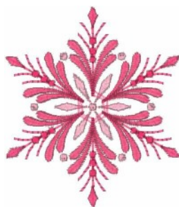
Æ eŠ a0_02.vip 2.54x2.92 inches; 3,007 stitches 3 thread changes; 3 colors