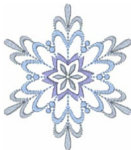
Æ eŠ a0_05.vip 2.55x2.93 inches; 2,662 stitches 3 thread changes; 3 colors