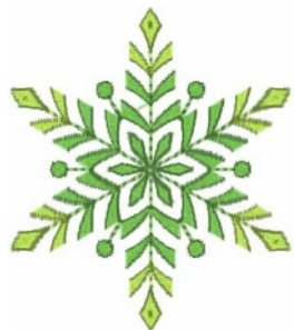
Æ eŠ a0_04.vip 2.35x2.71 inches; 2,296 stitches 3 thread changes; 2 colors