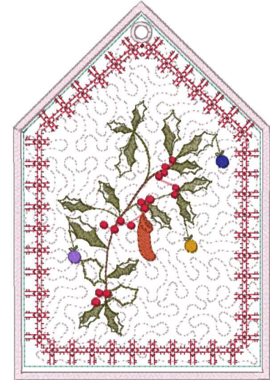
Bag-Side-2-5x7.vip 4.80x7.08 inches; 15,530 stitches 15 thread changes; 11 colors