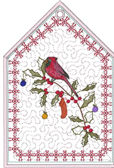
Bag-Side-1-5x7.vip 4.80x7.08 inches; 17,039 stitches 21 thread changes; 16 colors