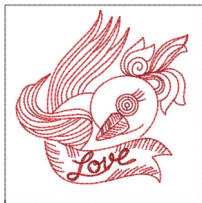
Love Bird Design-4in.vp3

2.95x2.95 inches; 2,647 stitches 2 thread changes; 2 colors