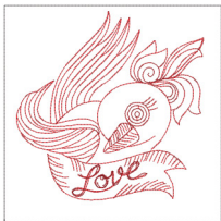
Love Bird Design-6in.vp3

5.04x5.04 inches; 3,921 stitches 2 thread changes; 2 colors