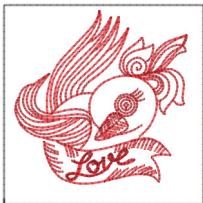
Love Bird Design-3in.vp3

2.95x2.95 inches; 2,647 stitches 2 thread changes; 2 colors