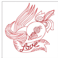
Love Bird Design-5in.vp3

3.86x3.86 inches; 3,198 stitches 2 thread changes; 2 colors