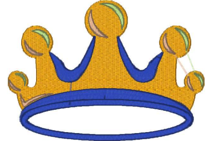
Crown 18052023 4 Inch.vip 3.78x2.69 inches; 8,627 stitches 4 thread changes; 4 colors