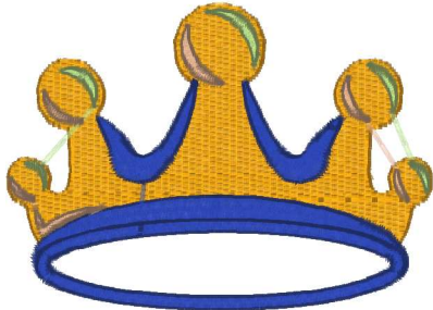
Crown 18052023 2_5 Inch.vip 2.47x1.77 inches; 5,041 stitches 4 thread changes; 4 colors