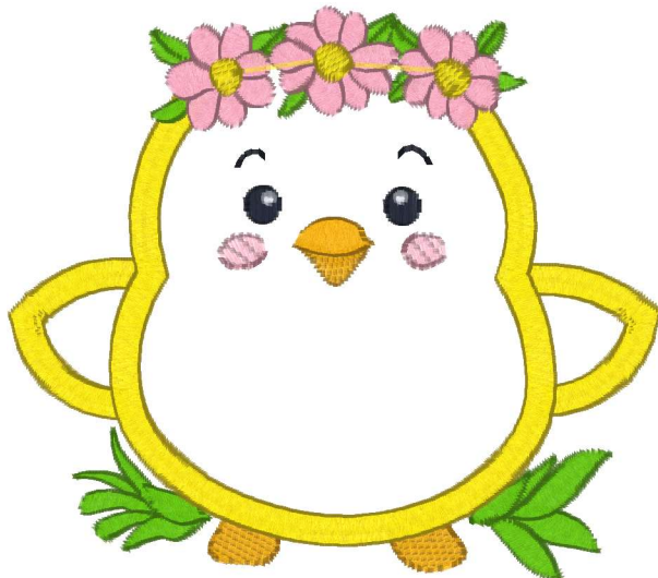
Design 4.vip 3.72x3.24 inches; 5,669 stitches 11 thread changes; 8 colors