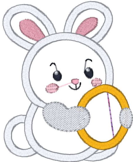
Design 1.vip 2.97x3.65 inches; 5,437 stitches 9 thread changes; 6 colors