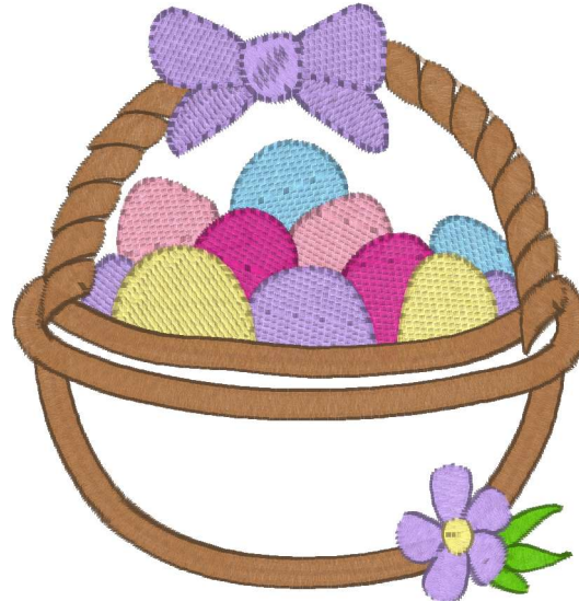
Design 2.vip 3.29x3.42 inches; 8,336 stitches 11 thread changes; 9 colors