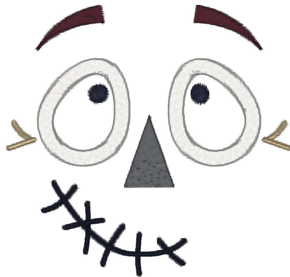
Boy Scarecrow Face Applique 70.vp3 2.76x2.63 inches; 2,993 stitches 7 thread changes; 7 colors