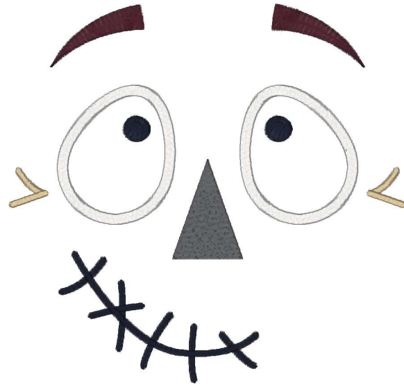
Boy Scarecrow Face Applique 145.vp3 5.71x5.44 inches; 6,259 stitches 7 thread changes; 7 colors