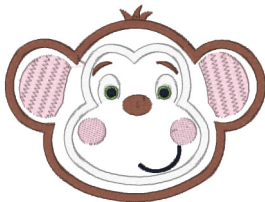
Kc Dezigns - Monkey Face Applique 4x4.vip 3.93x2.95 inches; 7,153 stitches 9 thread changes; 6 colors