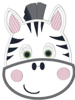
Kc Dezigns - Zebra Face Applique 5x7.vip 5.06x6.74 inches; 15,864 stitches 11 thread changes; 6 colors