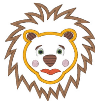
Kc Dezigns - Lion Face Applique 6x8.vip 5.71x6.08 inches; 14,331 stitches 12 thread changes; 9 colors