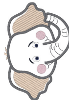
Kc Dezigns - Elephant Face Applique 6x8.vip 5.63x8.18 inches; 18,930 stitches 8 thread changes; 7 colors