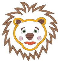
Kc Dezigns - Lion Face Applique 5x7.vip 5.11x5.45 inches; 12,681 stitches 12 thread changes; 9 colors