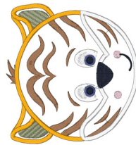
Kc Dezigns - Tiger Face Applique 6x8.vip 5.64x5.98 inches; 16,633 stitches 11 thread changes; 8 colors