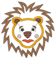
Kc Dezigns - Lion Face Applique 4x4.vip 3.64x3.89 inches; 8,955 stitches 12 thread changes; 9 colors