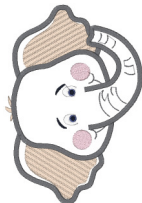
Kc Dezigns - Elephant Face Applique 5x7.vip 4.78x6.95 inches; 15,386 stitches 8 thread changes; 7 colors