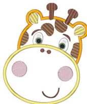
Kc Dezigns - Giraffe Face Applique 5x7.vip 5.07x6.01 inches; 12,165 stitches 12 thread changes; 9 colors