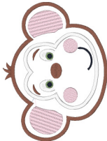
Kc Dezigns - Monkey Face Applique 5x7.vip 5.06x6.71 inches; 13,719 stitches 9 thread changes; 6 colors