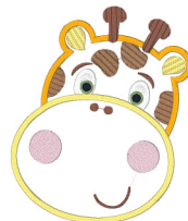
Kc Dezigns - Giraffe Face Applique 6x8.vip 5.64x6.69 inches; 14,010 stitches 12 thread changes; 9 colors