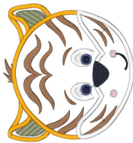
Kc Dezigns - Tiger Face Applique 5x7.vip 5.09x5.39 inches; 14,839 stitches 11 thread changes; 8 colors