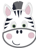
Kc Dezigns - Zebra Face Applique 6x8.vip 5.65x7.54 inches; 18,607 stitches 11 thread changes; 6 colors