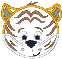
Kc Dezigns - Tiger Face Applique 4x4.vip 3.89x3.67 inches; 10,360 stitches 11 thread changes; 8 colors