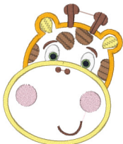
Kc Dezigns - Giraffe Face Applique 4x4.vip 3.32x3.91 inches; 6,944 stitches 12 thread changes; 9 colors