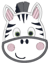
Kc Dezigns - Zebra Face Applique 4x4.vip 2.92x3.86 inches; 8,051 stitches 11 thread changes; 6 colors