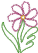
Bohemia 1 - 3c.vip

5.82x7.07 inches; 8,252 stitches 9 thread changes; 9 colors