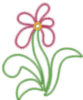
Bohemia 1 - 3b.vip

4.99x6.81 inches; 8,167 stitches 9 thread changes; 8 colors