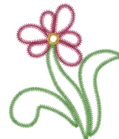
Bohemia 1 - 3d.vip

4.96x6.94 inches; 15,450 stitches 9 thread changes; 9 colors