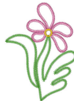
Bohemia 1 - 3a.vip

5.27x6.28 inches; 13,238 stitches 12 thread changes; 10 colors