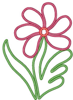
Bohemia 1 - 2c.vip

4.96x6.97 inches; 16,399 stitches 12 thread changes; 10 colors