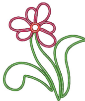
Bohemia 1 - 2d.vip

4.96x6.97 inches; 16,399 stitches 12 thread changes; 10 colors