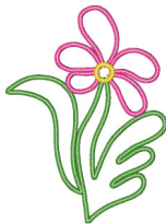
Bohemia 1 - 2a.vip

4.94x6.12 inches; 8,394 stitches 9 thread changes; 9 colors