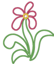
Bohemia 1 - 2b.vip

5.07x6.85 inches; 13,924 stitches 12 thread changes; 8 colors