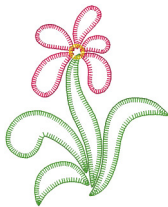
Bohemia 1 - 1b.vip

4.93x6.72 inches; 8,923 stitches 9 thread changes; 8 colors