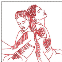
Girl And Boy Back To Back-4in.vp3 3.86x3.86 inches; 3,720 stitches 2 thread changes; 2 colors