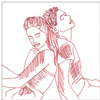
Girl And Boy Back To Back-6in.vp3 6.22x6.22 inches; 5,389 stitches 2 thread changes; 2 colors