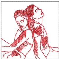
Girl And Boy Back To Back-3in.vp3 2.95x2.95 inches; 3,028 stitches 2 thread changes; 2 colors