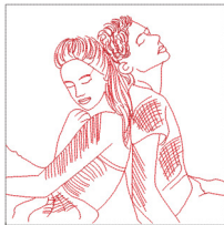
Girl And Boy Back To Back-7in.vp3 6.89x6.89 inches; 5,797 stitches 2 thread changes; 2 colors