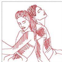
Girl And Boy Back To Back-5in.vp3 5.04x5.04 inches; 4,552 stitches 2 thread changes; 2 colors