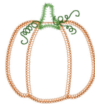
Sizzix Pumpkin 3.vip

4.71x5.27 inches; 6,577 stitches 8 thread changes; 6 colors