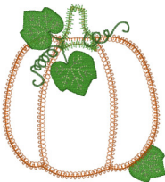
Sizzix Pumpkin 4.vip

4.72x5.27 inches; 4,873 stitches 6 thread changes; 6 colors