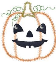
Sizzix Pumpkin 5.vip

4.89x5.37 inches; 10,540 stitches 10 thread changes; 7 colors