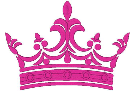
Crown 4.vip 8.27x5.91 inches; 17,459 stitches 1 thread changes; 1 colors