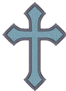
Cross 4 Inch.vip

2.17x2.97 inches; 4,098 stitches 2 thread changes; 2 colors