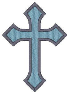
Cross 3 Inch.vip

2.17x2.97 inches; 4,098 stitches 2 thread changes; 2 colors