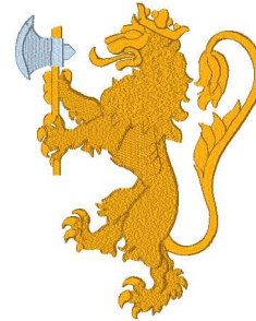
Norwegian Lion 7 Inch.vip 5.42x6.90 inches; 21,835 stitches 2 thread changes; 2 colors