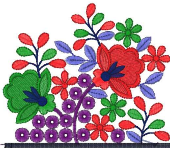
2 A- S.vip

8.18x3.67 inches; 22,313 stitches 6 thread changes; 6 colors