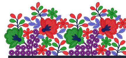
2 A- L.vip

2.17x2.54 inches; 3,273 stitches 4 thread changes; 4 colors