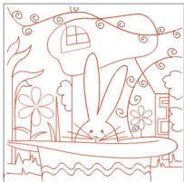
B-Easter-Bunny-Hat - 7in.vip 7.09x7.09 inches; 5,779 stitches 2 thread changes; 2 colors