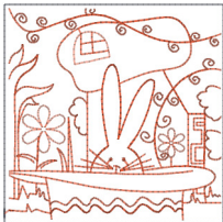
B-Easter-Bunny-Hat - 4in.vip 3.94x3.94 inches; 3,758 stitches 2 thread changes; 2 colors