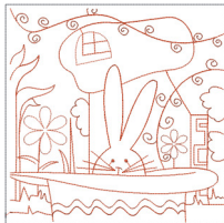
B-Easter-Bunny-Hat - 8in.vip 7.87x7.87 inches; 6,467 stitches 2 thread changes; 2 colors