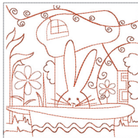
B-Easter-Bunny-Hat - 5in.vip 5.12x5.12 inches; 4,577 stitches 2 thread changes; 2 colors