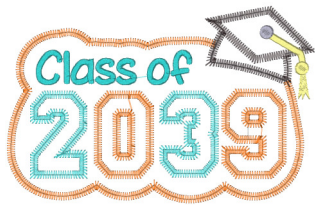
Ca-Zigzag Class Of 2039-8in.vip 7.77x4.98 inches; 6,848 stitches 15 thread changes; 7 colors