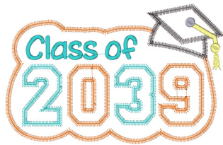
Ca-Zigzag Class Of 2039-9in.vip 8.74x5.59 inches; 7,719 stitches 15 thread changes; 7 colors