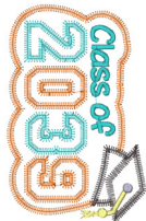
Ca-Zigzag Class Of 2039-6in.vip 3.73x5.82 inches; 5,167 stitches 15 thread changes; 7 colors