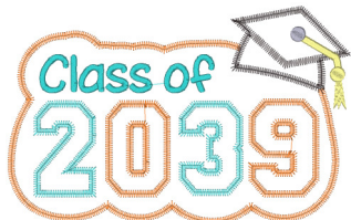
Ca-Zigzag Class Of 2039-10in.vip 9.71x6.20 inches; 8,584 stitches 15 thread changes; 7 colors