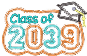
Ca-Zigzag Class Of 2039-5in.vip 4.84x3.12 inches; 4,340 stitches 15 thread changes; 7 colors