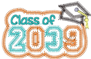
Ca-Zigzag Class Of 2039-4in.vip 3.87x2.50 inches; 3,496 stitches 15 thread changes; 7 colors