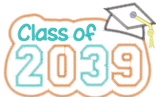
Ca-Zigzag Class Of 2039-11in.vip 10.69x6.81 inches; 9,435 stitches 15 thread changes; 7 colors