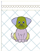
Front Part Puppy No Mylar.pes 7.86x10.09 inches; 22,900 stitches 21 thread changes; 12 colors