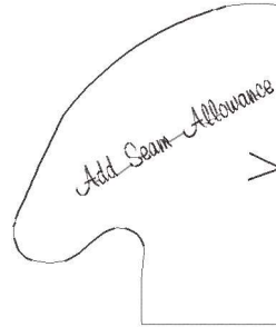
Hat And Hat Lining Part 2.vip 6.19x7.33 inches; 1,707 stitches 1 thread changes; 1 colors