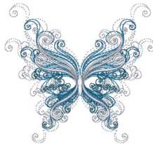
Tbobb curled in5x7.vip

5.00x5.59 inches; 25,398 stitches 5 thread changes; 3 colors