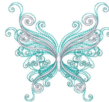
Tbobb curled lines5x7.vip

5.39x5.00 inches; 16,606 stitches 3 thread changes; 2 colors