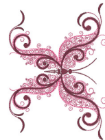
Tbobb curled tips5x7.vip

3.91x6.89 inches; 10,598 stitches 2 thread changes; 2 colors